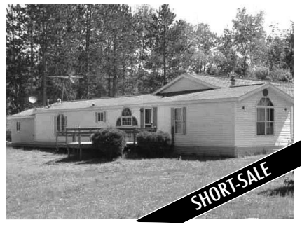
06834 FAIR ROAD, EAST JORDAN

Very well maintained mobile home with two large stick built additions. This living room has enough room for all! In addition there is a 30 x 30 detached garage and a 30 x 30 pole building all on 13 acres plus to roam! Close to the snowmobile trails, not far from Lake Patricia! MLS 434955. Ask for Jennifer Burr. $67,900