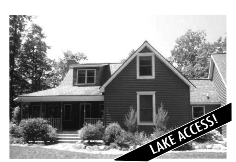
8835 BRANDONHEAD LANE, ELLSWORTH

Fantastic home and location for those who want privacy, access to the river and snowmobile trails. Beautiful frontage on the famed Jordan River allows for fishing or canoeing from your front yard. Pole barn for extra storage room. This would make a perfect primary or second home. MLS 435491. Ask for Mike Stark. $159,900.