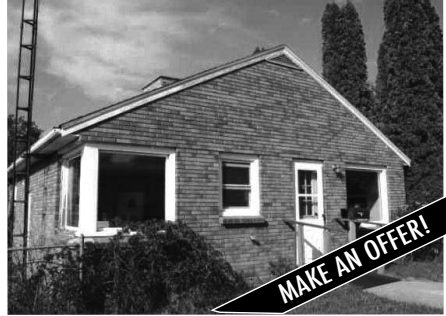
4310 U.S. 131 HIGHWAY, PETOSKEY This 3 bedroom home needs some TLC but has great views of Walloon Lake. MLS 435143. Ask for Holly Nierman. $70,000.

Great location! close to town, yet just out of the way off the main road. Large kitchen with lots of cabinet space, as well as a large combo dining/living area. The acreage give room to add or expand as well. MLS 432586. Ask for Mike Stark. $69,500