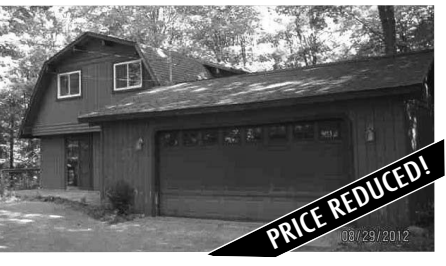
4610 DEL MASON, BELLAIRE

Very well maintained mobile home with two large stick built additions. This living room has enough room for all! In addition there is a 30 x 30 detached garage and a 30 x 30 pole building all on 13 acres plus to roam! Close to the snowmobile trails, not far from Lake Patricia! MLS 434955. Ask for Jennifer Burr. $67,900