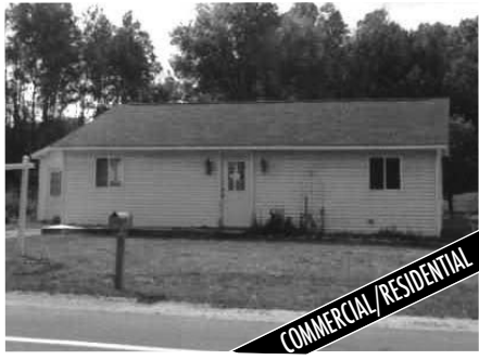
502 MAPLE, EAST JORDAN

Charming Victorian home with original woodwork on a large lot 233x157, there is a 8x22 greenhouse attached to the 2 car garage. Home is close to schools and near Lake Charlevoix. This sale is Subject to bank approval of a Short Sale. MLS 430279. Ask for Holly Nierman. $39,900