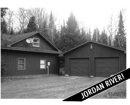
2452 MARTINSON DRIVE., EAST JORDAN

Style, charm and location! This home has it all as well as a very recent updates. Back vard is fenced in for convenience, and the home offers a nice front porch to enjoy the outdoors! Sitting in the heart of East Jordan, it is close to the schools, downtown and entertaining and an easy drive to work! MLS 435249. Ask for Jennifer Burr. $109,000