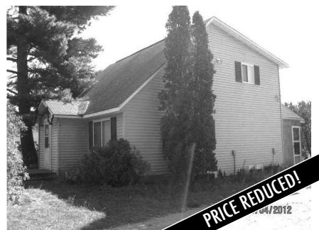
320 OLD STATE ROAD. BOYNE CITY

Although zoned C-1 for small business, this was previously used as a home and City says can still be. Detached garage with gas heater and a large corner lot! Very convenient location. Close to grocery store, schools, community park and downtown. Additional parcel in back is also available which provides room for a pole building. 435252. Ask for Mike Stark. $54,900