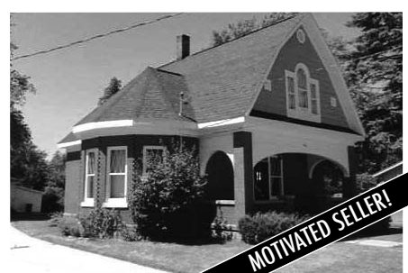
705 PROSPECT ST., EAST JORDAN

GORGEOUS! This custom built beauty has so much to offer. Enjoying nature and all its glory will become a favorite past time with the 3 season screened in porch room, pole barn for all your "toys", and use of the 80 acres of common land to explore and enjoy. The home itself brings a beautiful master suite for privacy, fireplace, windows in all the right locations, and a BONUS room above the garage for your choice of uses, too much to list!MLS 434374. Ask for Mike Stark $289,900