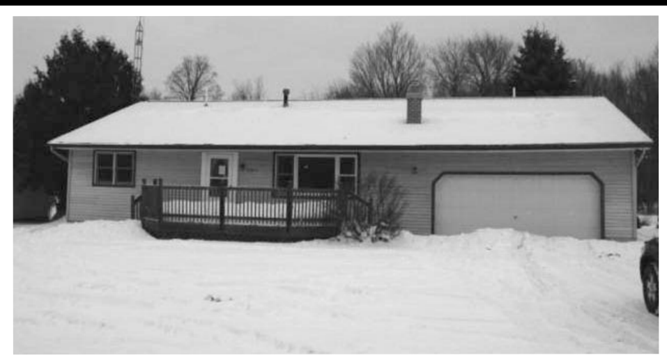
872 S M75 HIGHWAY BOYNE CITY