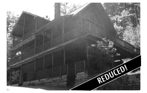
2105 SCHUSS MTN DRIVE, MANCELONA

Slightly rolling country side, mixed with some hardwoods and pines, makes this home with 66 plus acres appealing! Manufactured home features a breeze way additon attaching the garage as well as a 30 x 40 pole barn for storage or livestock. This one is priced to sell and won't last long! MLS 434964. Ask for Jennifer Burr. $184,900