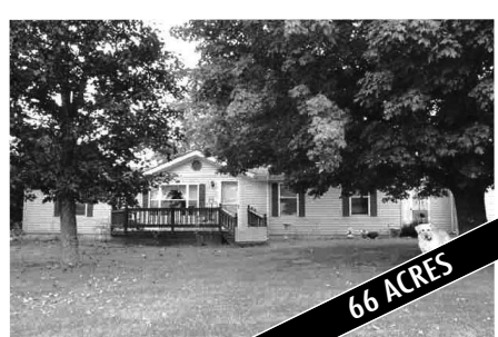
10132 LA CROIX RD., EAST JORDAN

Turn of the Century home with architectural charm! This home has recently had extensive remodeling and is ready for you to move right in! Beautiful wood floors, an updated kitchen, a formal dining room for entertaining, as well as a newer furnace and roof! Close to schools and downtown for your conveniences! Call to see today! MLS 430906. Ask for Jennifer Burr. $90,000.