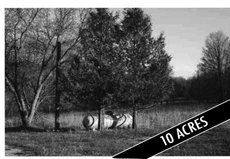
2235 VANCE ROAD • EAST JORDAN

Beautiful location, hilly wooded with well, septic, and electric in place with a concrete slab. This view is a must see!! Great place to put a getaway cabin or a year round home. MLS 433118. Ask for Holly Nierman. $24,444