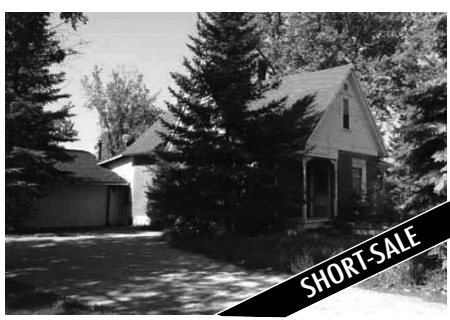
404 MILL, EAST JORDAN

Cute little house close to schools with large fenced yard, detached garage with access from alley. With a little updating this could be a gem! MLS 435637. Ask for Mike Stark. $30,000