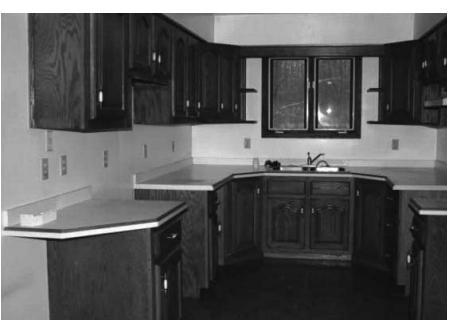
Want your property sold and closed? List with Stark Realty today!