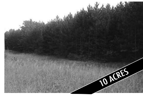
TBD STANEK ROAD, EAST JORDAN

Beautiful location, hilly wooded with well, septic, and electric in place with a concrete slab. This view is a must see!! Great place to put a getaway cabin or a year round home. MLS 433118. Ask for Holly Nierman. $24,444