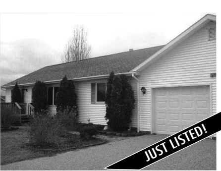
5035 LIT'L PINEY DRIVE., CHARLEVOIX

Wow! Turn key home in a great subdivision just south of Charlevoix. Nice ranch style floor plan with master suite at opposite end from other 2 bedrooms. Features include a nicely appointed kitchen and a full basement- and half of the basement is finished off with tongue and groove paneling. This one is move-in ready and priced to sell! MLS 435653. Ask for Mike Stark. $109,900.