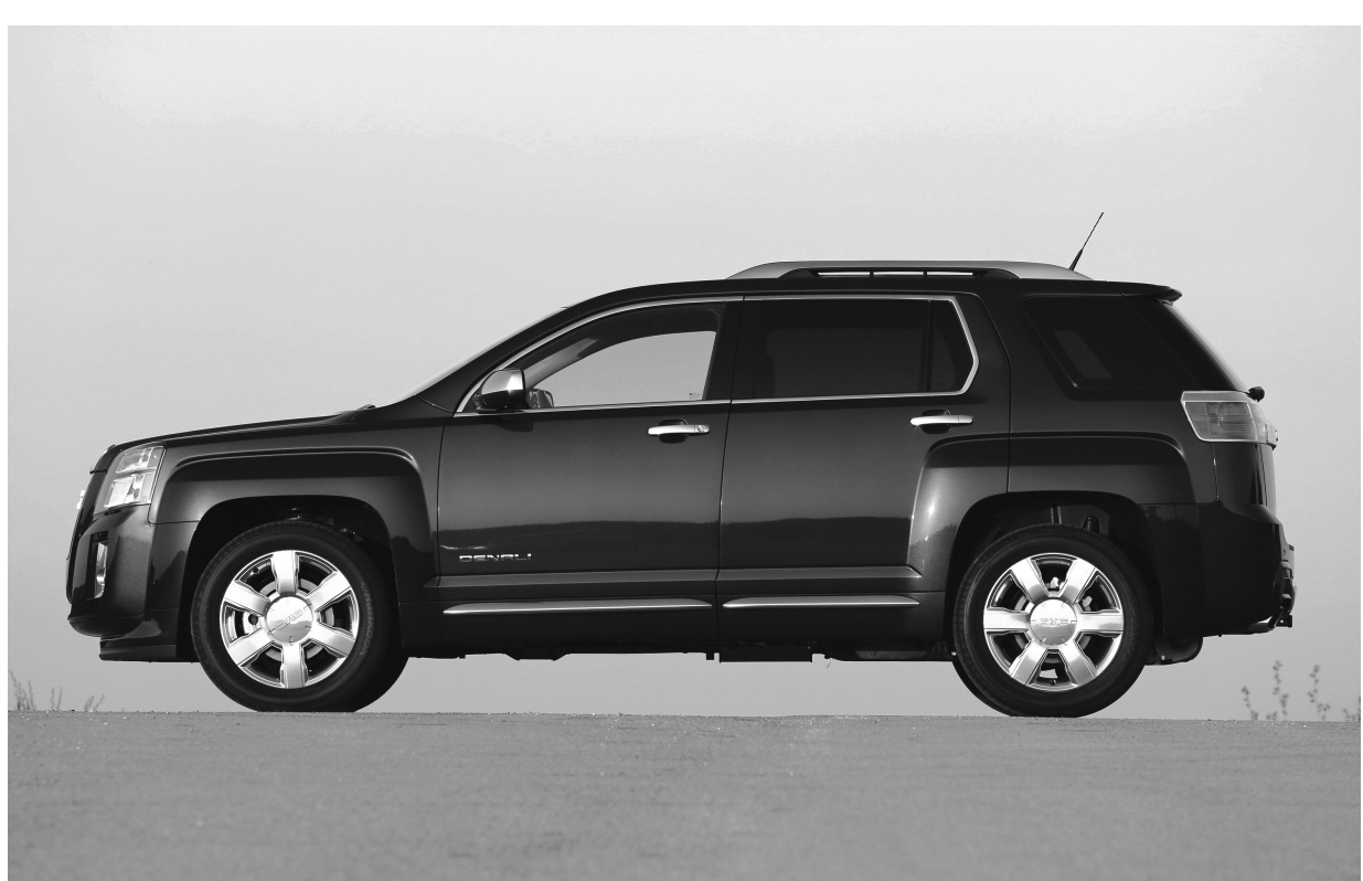
GMC's small SUV, the Terrain, had its best sales year ever in 2012.